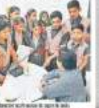
कच्ची सड़क होने से देर से पहुंचते हैं स्कूल, बनवा दो